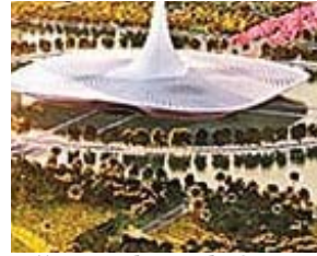
Vijayawada and Guntur along the banks of the Krishna River.

AMARAVATI, April 2: Amaravati's evolution as the people's capital of Andhra Pradesh has culminated in a historic moment, with Parliament granting it full legal status as the state's only capital after years of uncertainty, policy shifts, and legal battles. The journey began on June 2, 2014, when the Andhra Pradesh Reorganisation Act came into effect following the bifurcation of the state. Within months, on September 1, 2014, the government identified a new capital region between