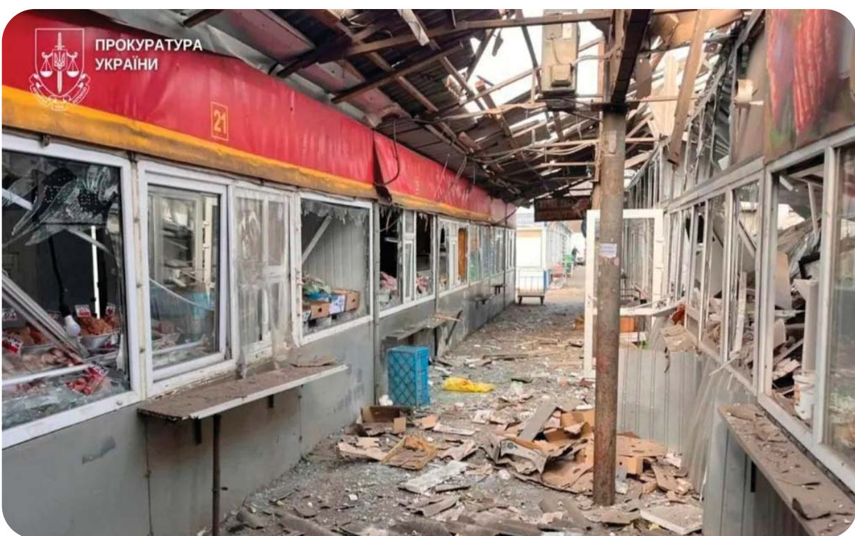
Russian attack on Ukraine market kills five