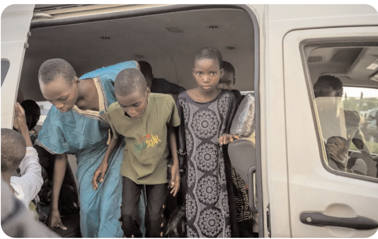
Toddlers among more than 50 schoolchildren kidnapped in Nigeria

to cool the area, vent gas and continue to search for victims. The incident took place near Makkasan train station in the city centre on Saturday afternoon. Deputy Transport Minister Siripong Angkasakulkiat said initial reports suggested the bus had stopped on the tracks amid heavy traffic, preventing crossing barriers from closing. The train carrying containers was not able to stop in time, he added. The full cause of the crash is still under investigation, authorities say.