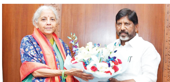
Delhi. Vikramarka highlighted the state's investments in education, healthcare, rural infrastructure, and human

Telangana has requested an additional Rs.5,000 crore from the Centre under the Scheme for Special Assistance to States for Capital Investment (SASCI). Deputy Chief Minister and Finance Minister Mallu Bhatti Vikramarka made the appeal to Union Finance Minister Nirmala Sitharaman in New