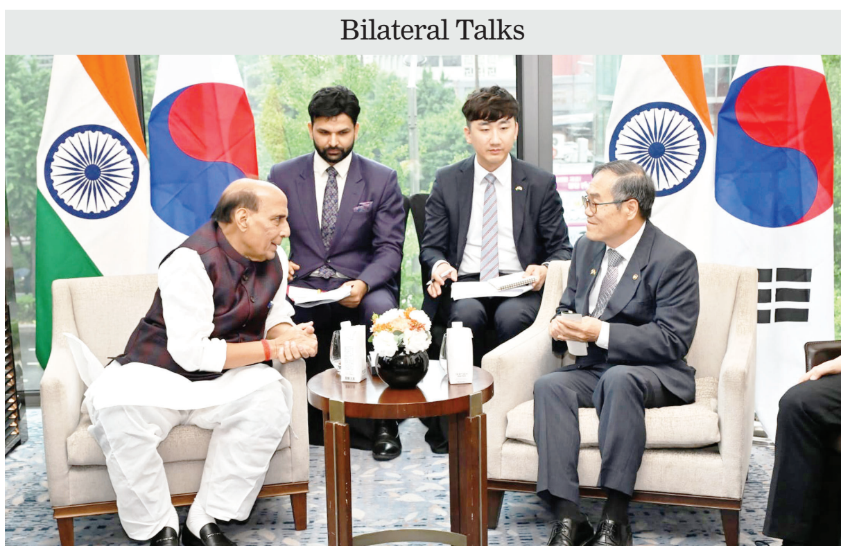
The Union Minister for Defence, Raj Nath Singh meets the Minister Defense Acquisition Program Administration, Republic of Korea, Mr Lee Yong-chul at Seoul, in South Korea....

International benchmark Brent crude futures slipped 0.9 per cent or nearly $1 to $110.28 per barrel, while US West Texas Intermediate (WTI) crude futures declined about 1 per cent or $1.03 to $103.12 per barrel. Moreover, both benchmarks had already fallen nearly $1 in the previous session following signs of progress in talks between Washington and Tehran.