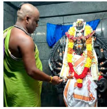
JWALA VEERABHADRA SWAMY POOJA IN SRISAILAM