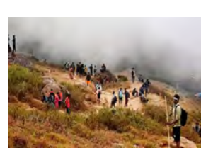
Velliangiri Andavar Temple is located at Poondi on the foothills of the Western Ghats near Coimbatore. Devotees traditionally trek up to the

COIMBATORE: Devotees have been temporarily barred from trekking the famous Velliangiri Hills from Wednesday (May 13) following heavy rain warnings issued for the Western Ghats region, forest officials announced. Thiruvananthapuram-Nagercoil third line moves ahead as SR floats final survey tender According to a Daily Thanthi report, the renowned