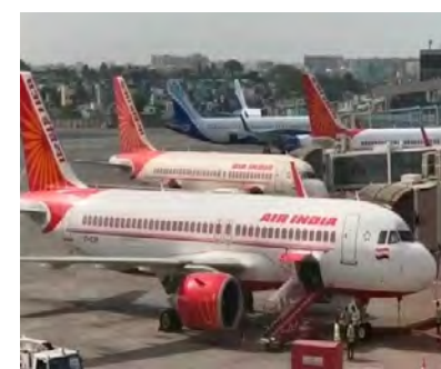
International Airport at 1:40 am, while the return service from Singapore reaches Chennai at 11:40 am. The route is widely used by tourists, business travellers, students and passengers flying onward to destinations such as Australia via Singapore. The flights are usually reported to operate at near-full capacity. Air India has also reduced the frequency of several other international services. Flights between Delhi and Singapore have been cut from 24 weekly services to 14, while

CHENNAI: Air India has announced the temporary suspension of its daily direct Chennai-Singapore flight service in both directions from June 1 to August 31, citing rising aviation fuel prices and continued airspace restrictions in several regions. Thiruvananthapuram-Nagercoil third line moves ahead as SR floats final survey tender The airline said passengers who have already booked tickets for the affected period can either reschedule their travel to alternative dates without additional charges or opt for a full refund. The move has come as a shock to passengers, especially as Air India had already suspended direct services from Chennai to destinations such as Dubai and Sri Lanka a few months ago. For several years, Air India has operated two daily direct passenger flights between Chennai and Singapore. The Chennai-Singapore flight departs Chennai