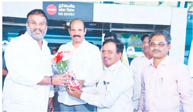
INFORMATION & PUBLIC RELATIONS AND HOUSING MINISTER KOLUSU PARTHASARATHI AND ANDHRA PRADESH STATE TRANSPORT, YOUTH & SPORTS MINISTER MANDIPALLI RAMPRASAD REDDY ARRIVED AT RENIGUNTA AIRPORT ON THEIR WAY TO NELLORE FOR AN OFFICIAL VISIT.

Visakhapatnam (TSIT) A capacity building workshop on the National Clean Air Programme (NCAP) and Heat Stress was organized on Wednesday at Novotel in Visakhapatnam. The programme was jointly conducted by the Bengaluru-based Centre for Study of Science, Technology and Policy (C-STEP), Artha Global, and GVMC. Extensive discussions were