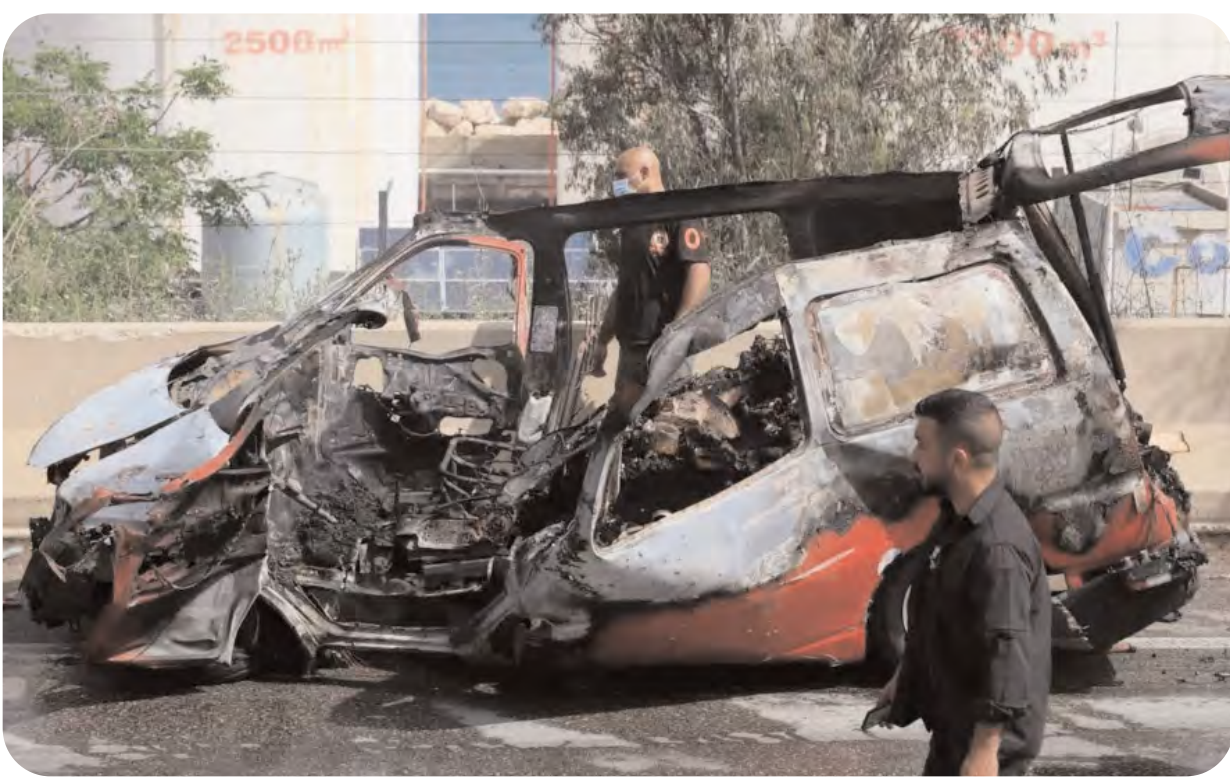
Israeli strikes in southern Lebanon kill 22 people, health ministry says