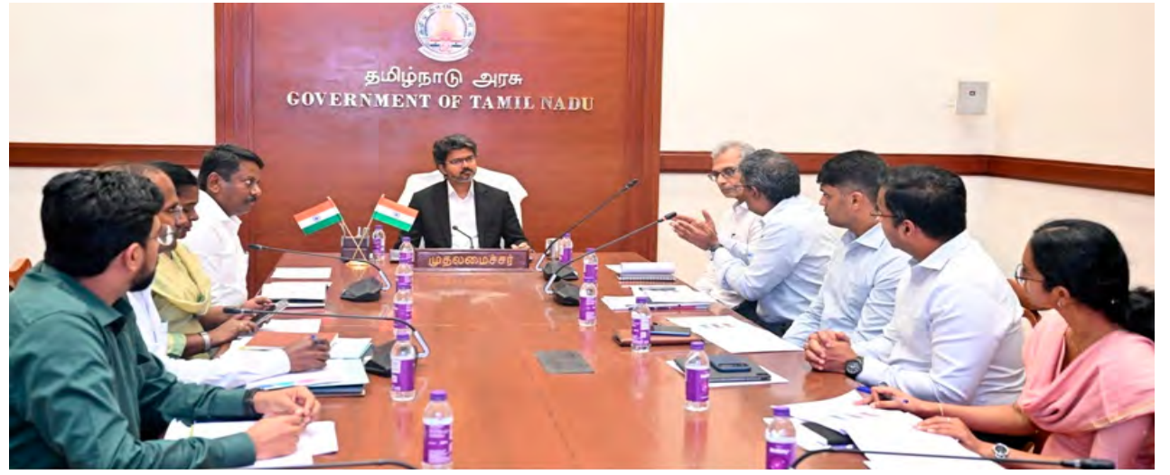
Honble Chief Minister chaired a review meeting on the financial position of the State and functioning of Finance Department in Secretariat

Sources indicated that Vijay may issue fresh directives on preventive policing, stronger intelligence coordination and faster administrative response systems to improve governance delivery at the district level. The meeting is also expected to include a broader review of the implementation of flagship government schemes and administrative performance across departments.