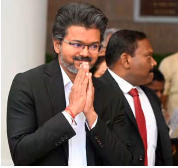
According to party instructions issued to district and constituency functionaries, candi-

The visit comes amid a wider organisational exercise initiated by the party leadership, which has directed all TVK candidates who contested the election and the party's newly elected legislators to personally visit their respective constituencies and express gratitude to the electorate.