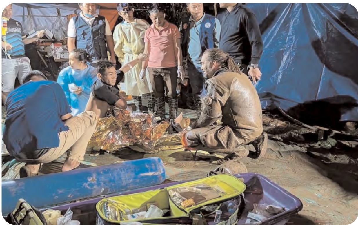
Four more men freed from flooded Laos cave after 10 days