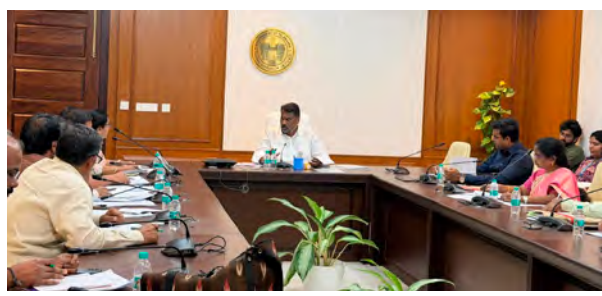
review meeting at Dr. B.R. Ambedkar Telangana Secretariat on Wednesday,

Hyderabad TSIT: Telangana Welfare Minister Adhuri Laxman Kumar has directed officials to ensure that the transfer process in departments under the Welfare Ministry is conducted in a completely transparent, fair and dispute-free manner, giving utmost priority to employee welfare, equality and convenience. Chairing a high-level