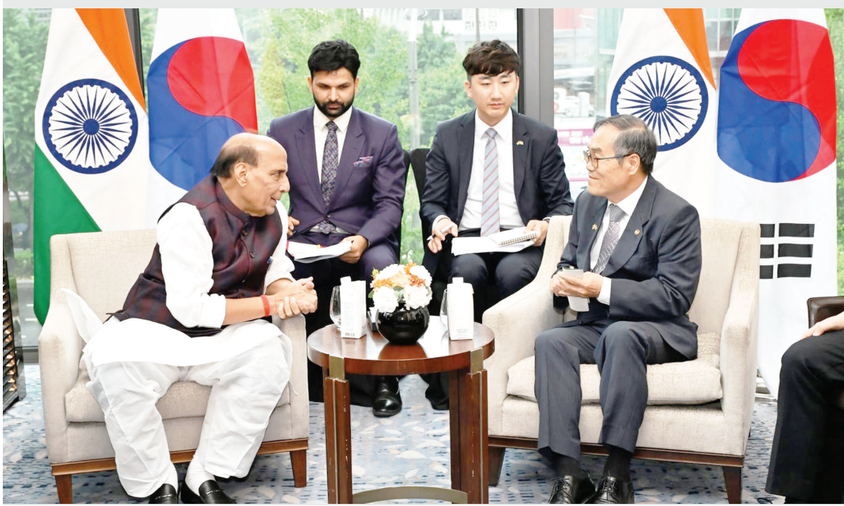
The Union Minister for Defence, Rajnath Singh meets the Minister Defense Acquisition Program Administration, Republic of Korea, Mr Lee Yong-chul at Seoul, in South Korea....