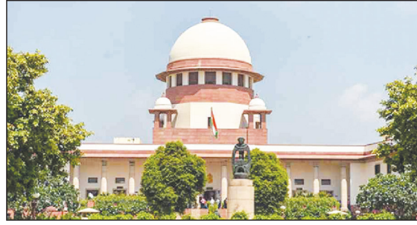
ommendation of a Selection Committee consisting of the Prime Minister, a Union Cabinet Minister,

tional validity of a new law governing the appointment of the Chief Election Commissioner (CEC) and the Election Commissioners (EC). The Chief Election Commissioner and Other Election Commissioners (Appointment, Conditions of Service and Term of Office) Act, 2023, which came into force on January 2, 2024, mandates that the CEC and the ECs are appointed by the President on the rec-