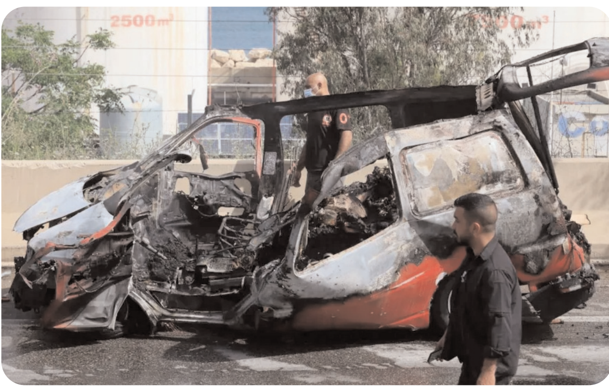
Israeli strikes in southern Lebanon kill 22 people, health ministry says