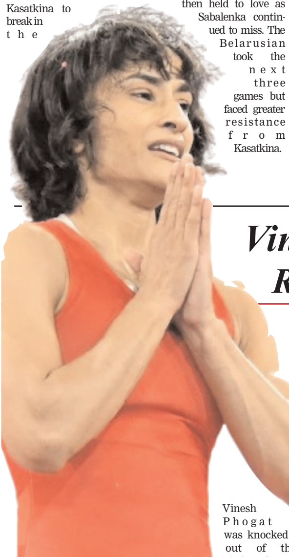
Vinesh Phogat was knocked out of the Asian Games

opening game. The Australian then held to love as Sabalenka continued to miss. The Belarusian took the next three games but faced greater resistance from Kasatkina.