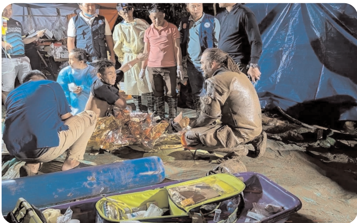
Four more men freed from flooded Laos cave after 10 days

ing laws "more robust, more encompassing and more stringent in dealing with the practices of LGBTQ+". Anyone who identifies as an "ally", a general term for a supporter of LGBTQ+ people, could also face a prison sentence. Exemptions were included for legal, media and healthcare professionals who report on LGBTQ+ issues or provide medical treatment or other services for gay people. Human Rights Watch recommended the bill be abandoned in a formal submission to the constitutional and legal affairs committee scrutinising the legislation in the capital, Accra. Ghana passed a similar bill in 2024 but it did not become law after former President Akufo-Addo failed to sign it amid legal challenges. The current President Mahama has indicated he would support the bill's passage, saying shortly after he took office that "I believe in the principles and values that only two genders exist - man and woman - and that marriage is between a man and a woman."