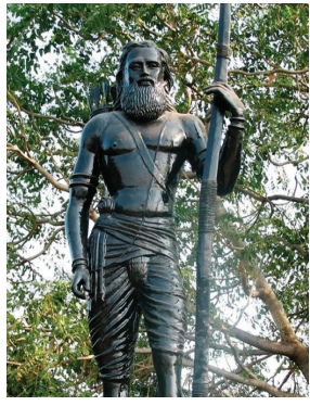
Statue of Alluri Sitarama Raju, a freedom fighter, in a field.

Amaravati, May 7 : Andhra Pradesh Chief Minister N. Chandrababu Naidu, Governor S. Abdul Nazeer and leaders of various political parties on Thursday paid rich tributes to legendary freedom fighter Alluri Sitarama Raju on his death anniversary. Chief Minister Chandrababu Naidu described Sitarama Raju as a revolutionary warrior who ignited the spirit of valour in the hearts of the Manyam people for the protection of tribal rights.