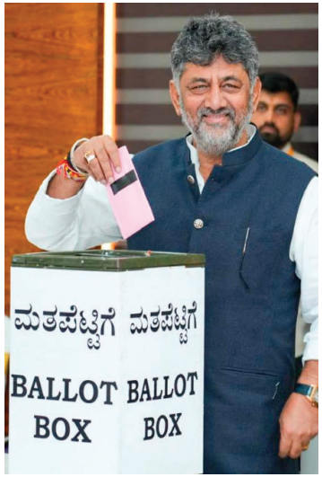
177 TMC of Cauvery water as directed by the Supreme Court. He

The Chief Minister stated that Karnataka is committed to releasing Tamil Nadu's allocated share of