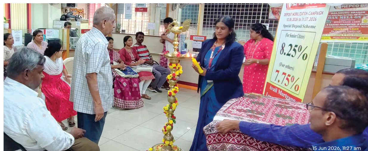
15 Jun 2026, 11:27 am

Bank officials and customers participated in the inaugural function and welcomed the initiative, which is expected to attract a large number of depositors during the campaign period.