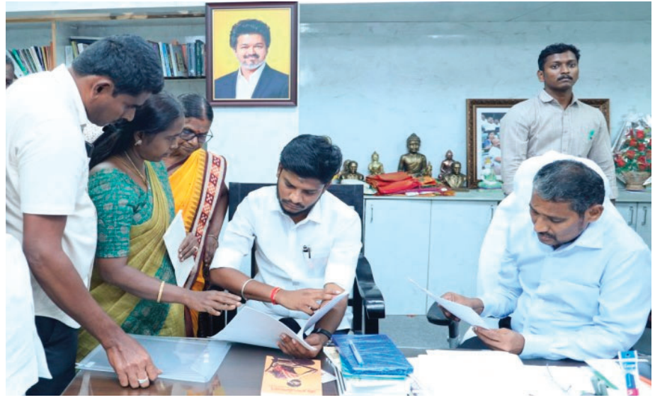
Minister for Hindu Religious and Charitable Endowments receives public petitions in the presence of Hon'ble Minister for Social Justice...