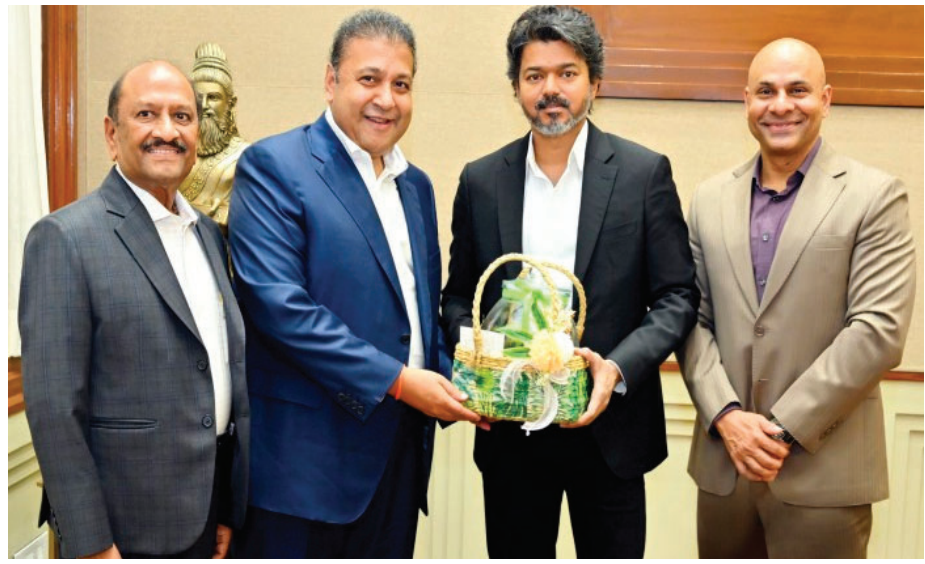
GMR Group Delegation called on the Honble Chief Minister..