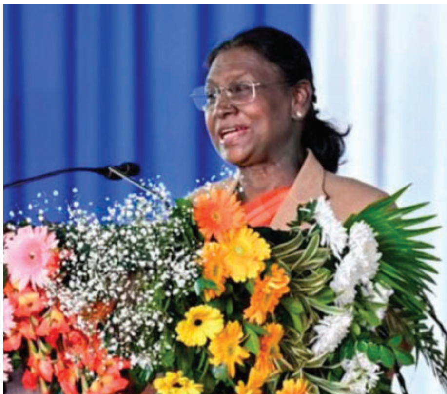
Patel and Union Minister of State for Tribal Affairs Durga Das Uikey were present on the occasion. The President said that the tribal society comes forward in every aspect of life. According to the

Indian philosophy of life, real empowerment happens when society is empowered in other things along with economic development, she said. In today's fast-paced world, driven by a culture of consumption, spiritual awareness in every segment of society becomes crucial, she said.