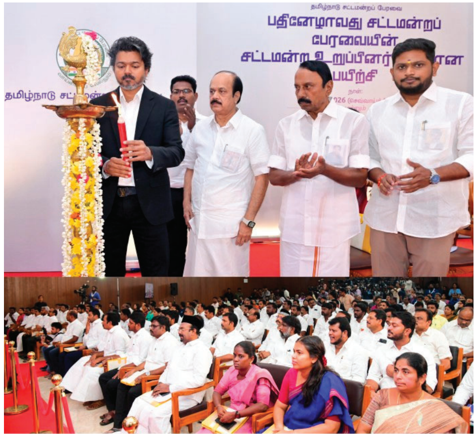
Chief Minister inaugurated the training programme for Members of the 17th Legislative Assembly by lighting the lamp at Kalavaivar Arangam, Chennai, in the presence of the Honble Speaker of the Legislative Assembly.