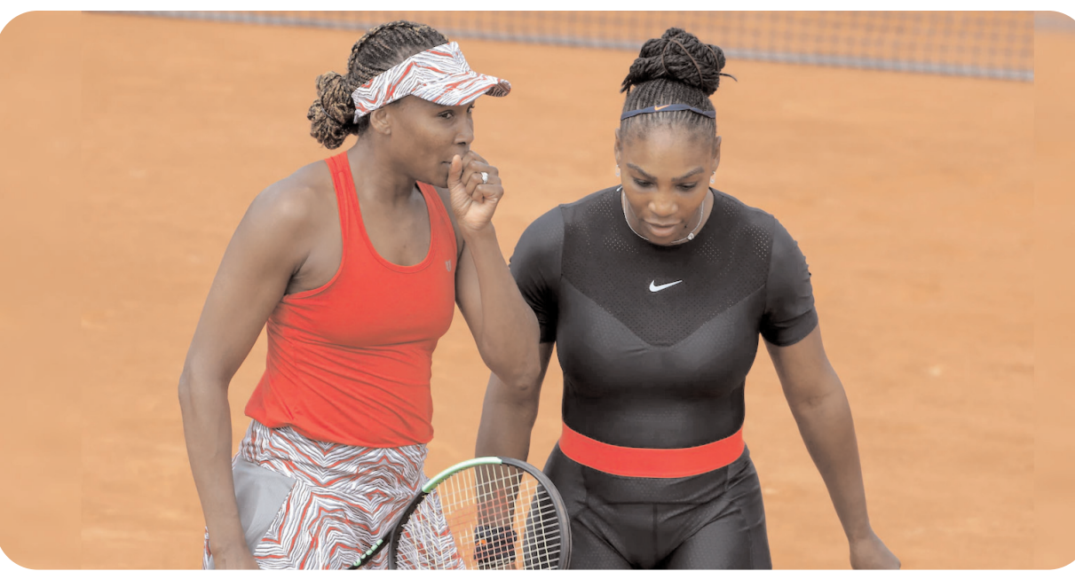
Serena And Venus Williams To Play Doubles Together At Wimbledon