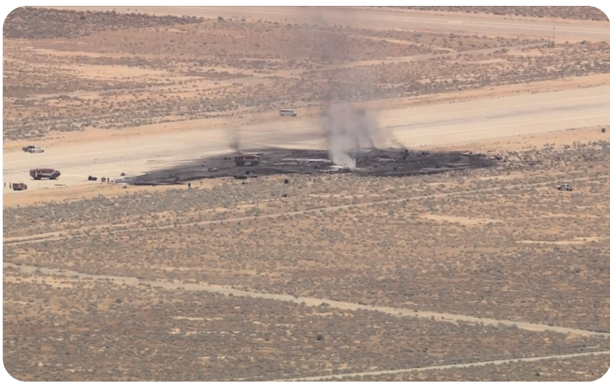
Eight dead after US Air Force B-52 bomber crashes in California