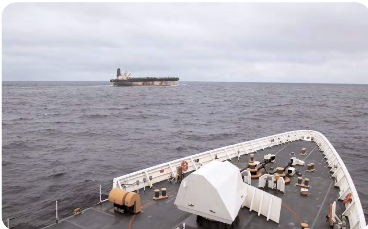
France seized sanctioned Russian oil tanker with UK help

Authorities say up to 50 officials will be deployed to patrol neighbourhoods and impose the fines. "We cannot tolerate littering simply because there are no rubbish bins," the Shibuya Ward authorities said in a press release. "We ask for your cooperation in creating a city where everyone can enjoy themselves comfortably." Rubbish bins are notoriously scarce in Japan, partly due to safety concerns after past terror attacks in the country and abroad. In a government survey last year, the lack of public rubbish bins was ranked the biggest inconvenience for tourists, cited by more than 20% of some 4,000 foreign visitors. Tourism has soared in Japan after the Covid pandemic, fuelled by a weakened yen and high social media interest. But the massive influx of tourists is testing the country's urban infrastructure and local populations. In the town of Fujiyoshida, near Mount Fuji, tourism has led to chronic traffic congestion and litter, as well as disruption to local residents' lives.