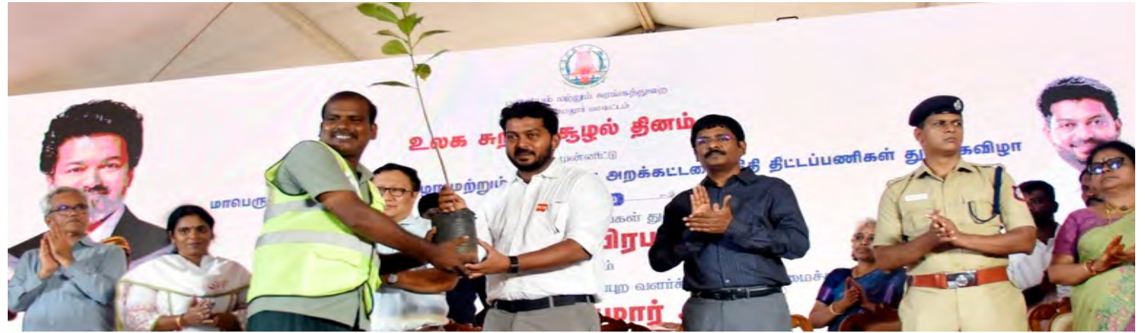
Honble Minister for Natural Resources launched a mega tree plantation drive, distributed safety equipment and inaugurated district mineral foundation fund projects on World Environment Day

Nadu in the immediate future. Recalling that Kuruvai cultivation covered 6.13 lakh acres last year, Anbumani warned that the cultivated area could fall below 3 lakh acres this season if water is not released from Mettur on schedule. Such a situation would result in income losses for farmers and affect employment opportunities for agricultural labourers, he said. To mitigate the impact, he urged the state government to support farmers in undertaking Kuruvai cultivation using ground-water resources. He called for the immediate announcement of the Kuruvai special package, including subsidised seeds, fertilisers and micronutrients for farmers across Tamil Nadu. Anbumani also demanded that the scheme be extended to all eligible farmers without any acreage cap.