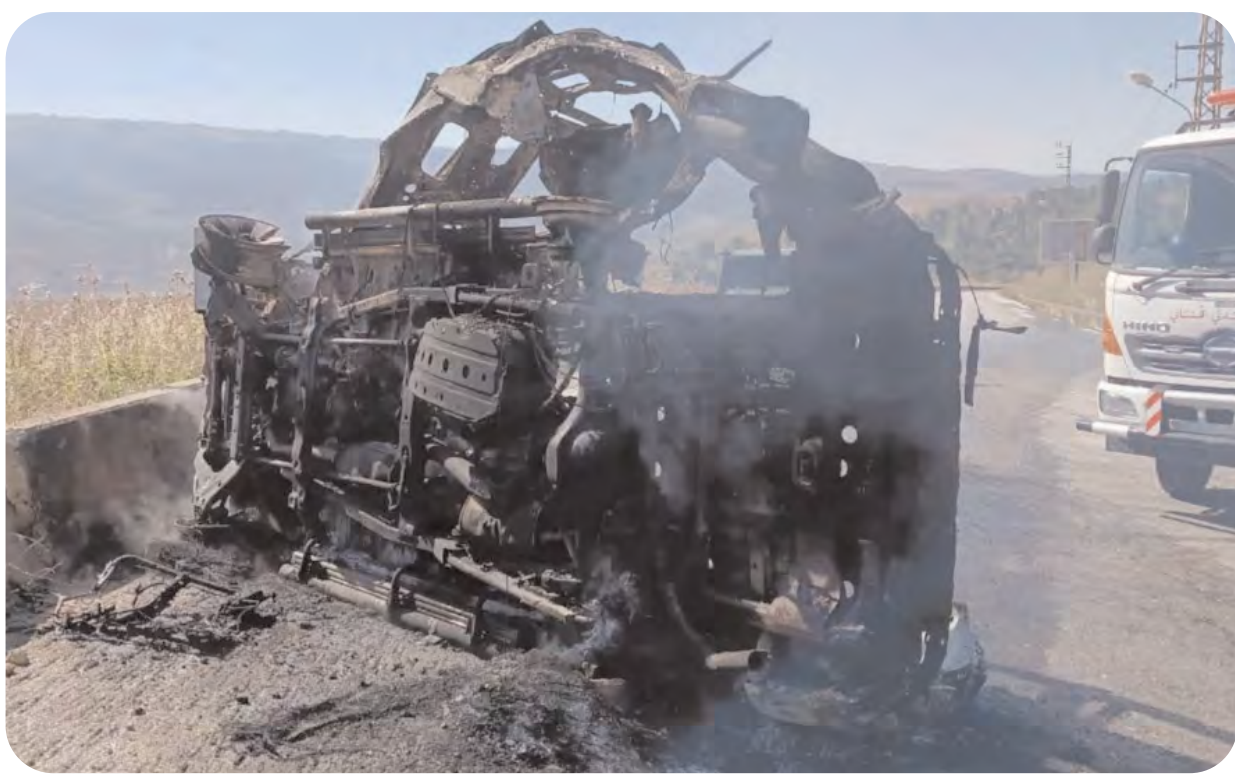
Lebanon says three soldiers killed in Israeli attack on car

out two years later when the country's former spy chief, Arthur Fraser, highlighted the alleged theft in an explosive dossier that he sent to the police. Fraser, a close ally of former President Jacob Zuma, who Ramaphosa replaced, accused the head of state of hiding the theft from the police and tax authorities. At the time Ramaphosa said there was "no basis for the claims of criminal conduct". As the stolen cash was in foreign currency, it meant that exchange control laws could also have been contravened. The reserve bank looked into the issue and found that there were no violations of the exchange control act and the public protector, who investigates allegations of abuse of power, found no wrongdoing on the president's part. But parliament also began an impeachment process and established an independent panel to investigate the allegations. It came to some damning findings, including saying there was "substantial doubt about the legitimacy of the source of the currency that was stolen" and concluding that Ramaphosa "has a case to answer".