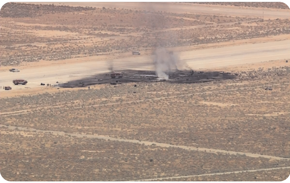
Eight dead after US Air Force B-52 bomber crashes in California