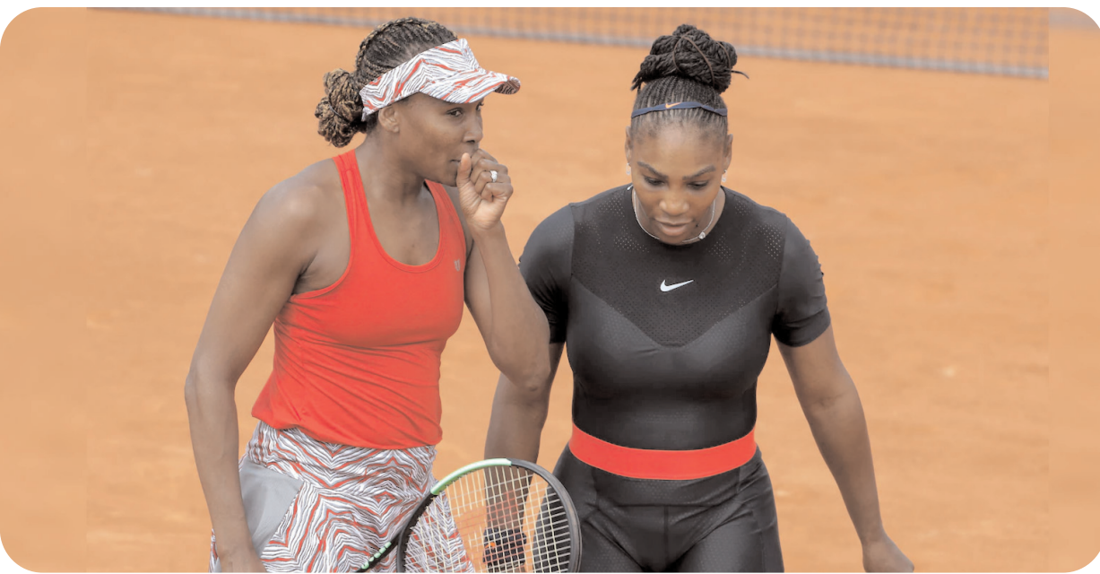
Serena And Venus Williams To Play Doubles Together At Wimbledon