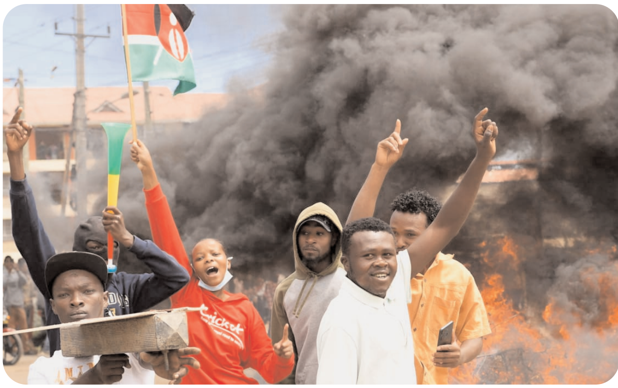
Two people shot dead amid Kenya protests against US Ebola quarantine centre plan

with Foreign Minister Abbas Araghchi saying the US-Iran truce was "unequivocally a ceasefire on all fronts, including in Lebanon" and that "its violation on one front is a violation of the ceasefire on all fronts". Separately, Iran's Tasnim news agency reported that Tehran could suspend indirect negotiations with the US over Israeli military actions in Lebanon. The news agency - which is affiliated with Iran's powerful Islamic Revolutionary Guard Corps (IRGC) - also said Iran and its allies could "activate other fronts, including the Bab al-Mandab Strait" at the entrance of the Red Sea. But in later posts on Truth Social, Trump insisted that talks with Iran were continuing at a "rapid pace" and said he had spoken to both Netanyahu and representatives from Hezbollah.