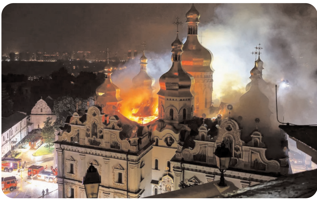
Russian strikes kill 11 and set historic cathedral in Kyiv ablaze