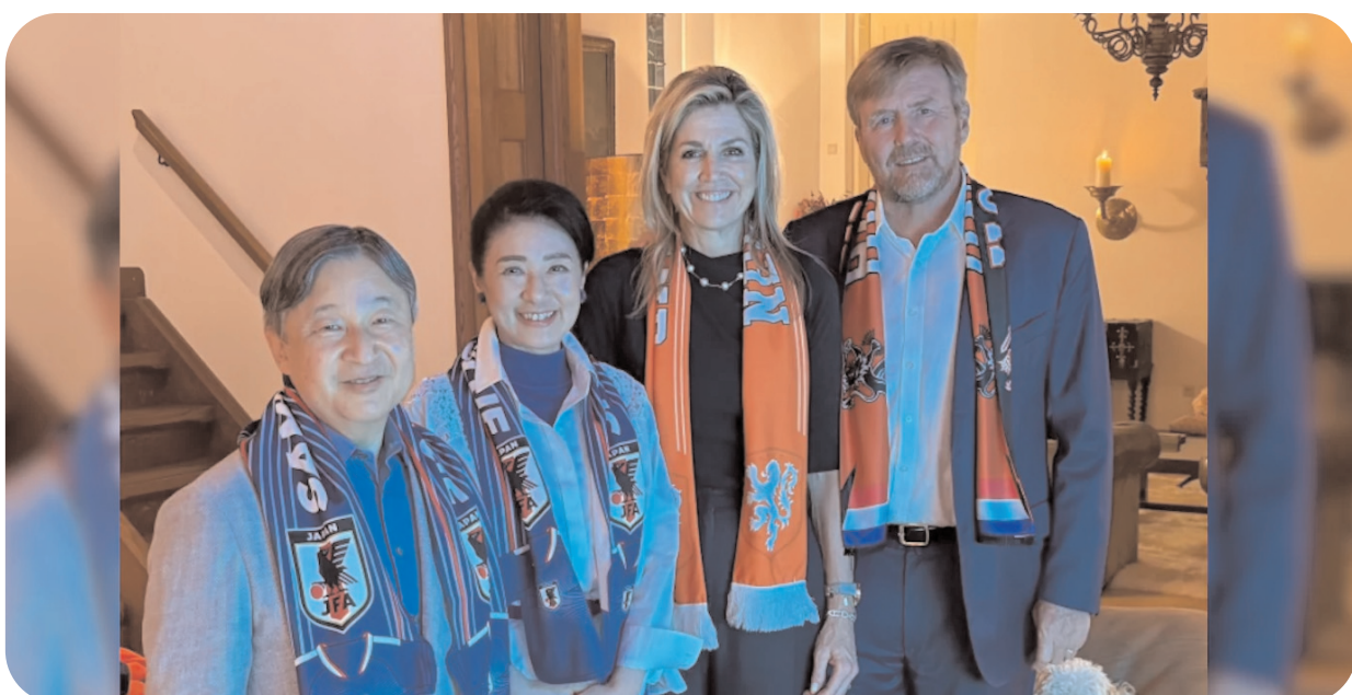
Emperor Naruhito, King Willem-Alexander Witness Japan vs Netherlands Clash