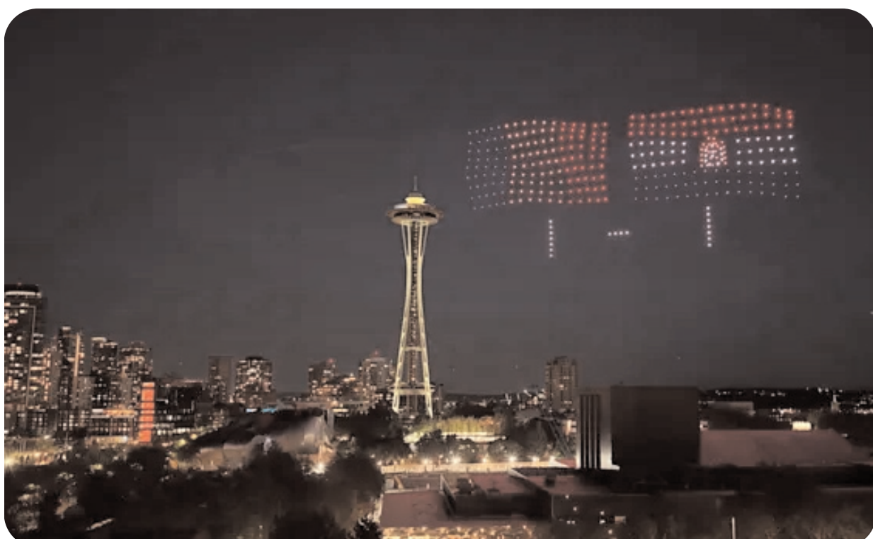
Drones create the first-ever Fifa scoreboard in Seattle sky