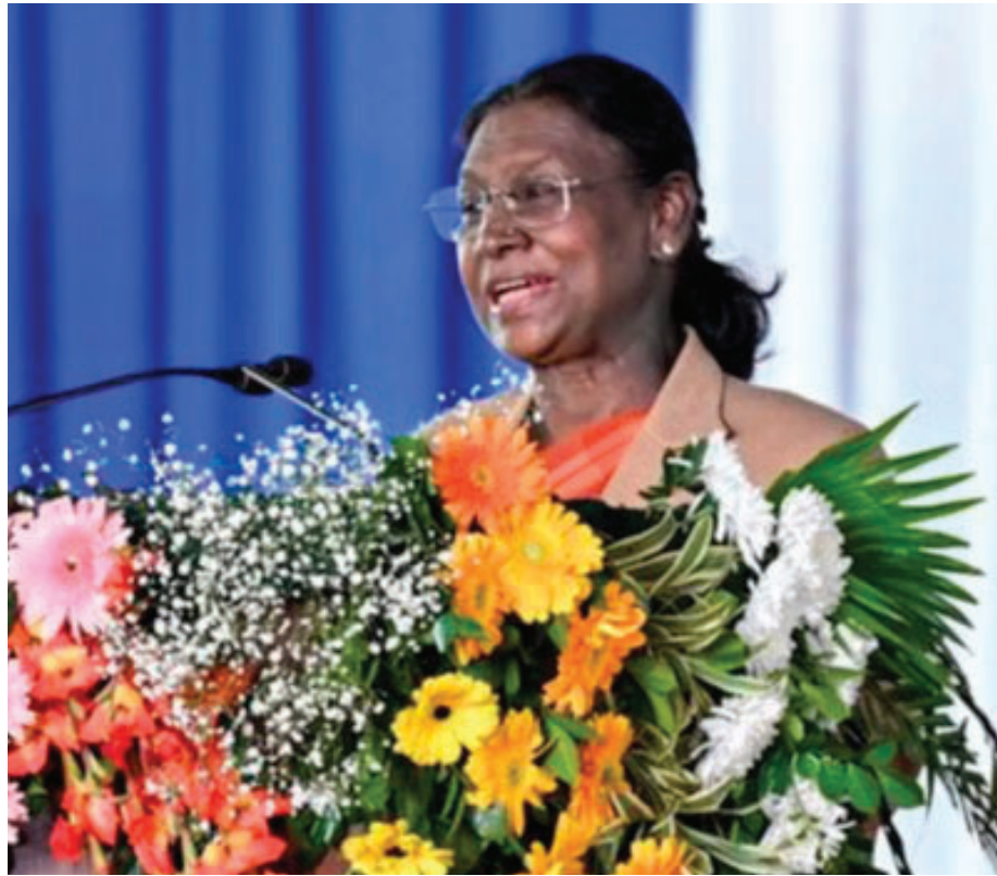
Patel and Union Minister of State for Tribal Affairs Durga